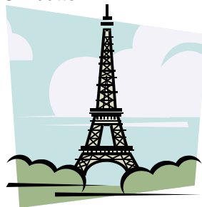
Eiffel Tower in Paris, France.